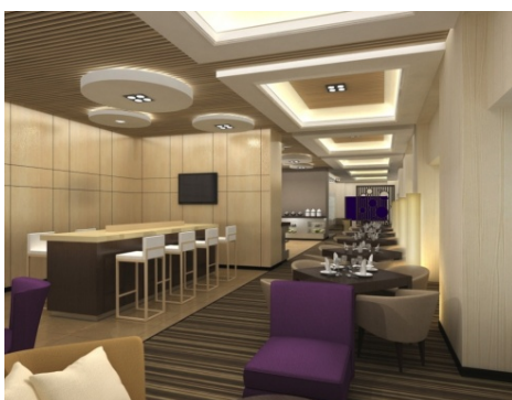
(top and right) Caterpillar (Suzhou) Co., Ltd. 卡特彼勒(苏州)有限公司